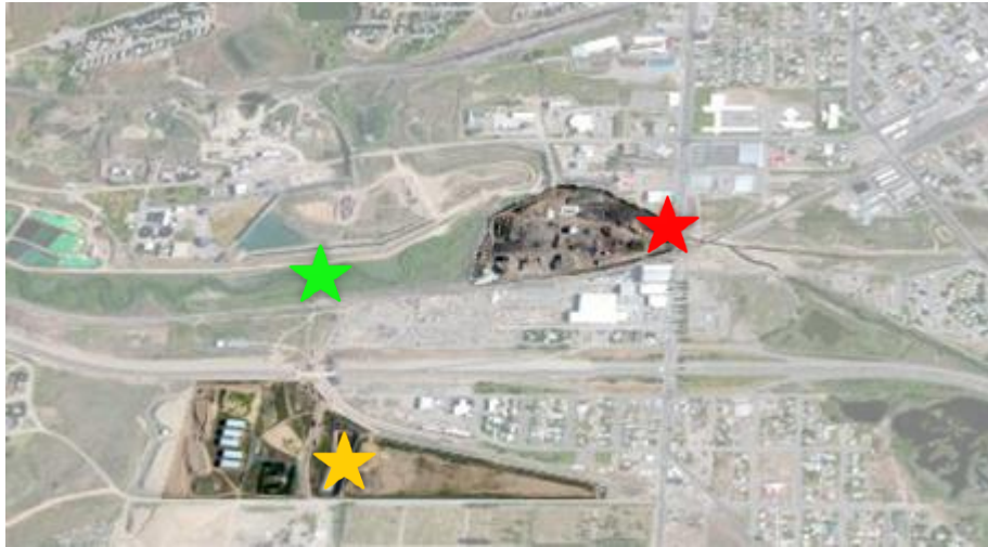
★ Old Site ★ New Site ★ Silver Bow Creek