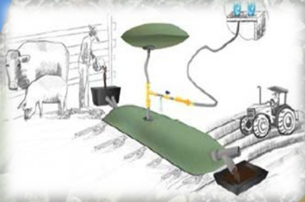
Sistema Biobolsa: biodigester process

We are facing a new era of positive sustainable changes in developing countries, and Mexico is one of them. Our capstone group had the unique opportunity to meet wonderful entrepreneurs during our Spring break trip.