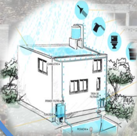
Isla Urbana: Rain water harvesting process