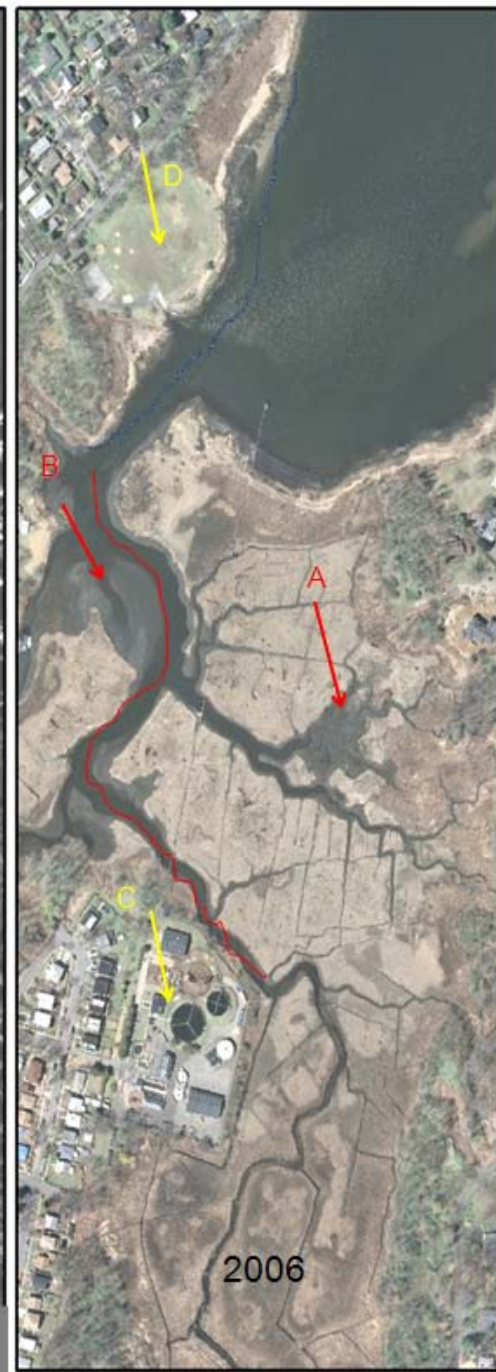
Udalls Cove, Queens, NY