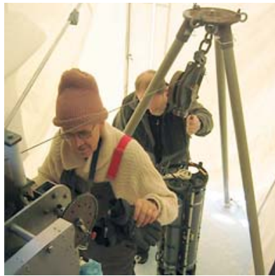
Scientists deploy an instrument specially designed to measure conductivity, temperature, depth and dissolved oxygen beneath the Arctic ice.

State of the Planet 2006 Conference: Is Sustainable Development Feasible?